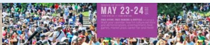
2015 年 5 月 23-24 日亞洲節