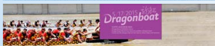
2015 年 5 月 17 日龍舟大賽