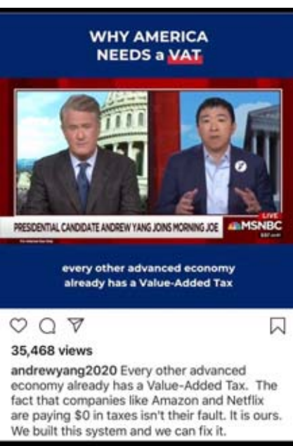
35,468 views andrewyang2020 Every other advanced economy already has a Value-Added Tax. The fact that companies like Amazon and Netflix are paying $0 in taxes isn't their fault. It is ours. We built this system and we can fix it.

Moreover, it appears to me just about all your MSNBC talk host shows from Morning Joe to the 11th Hour have reported very few (& limited airtime) almost next to nothing, Andrew's policies for America. Morning Joe gave him 5 minutes & 20 seconds and Andrew Yang did not come in till the very ending session of his show. I woke up at 3:00 AM (PT) and waited until 5:50 AM (PT) to catch a glance of this interview.